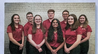
NET 2024 Traveling team

All youth from the Archdiocese are welcome