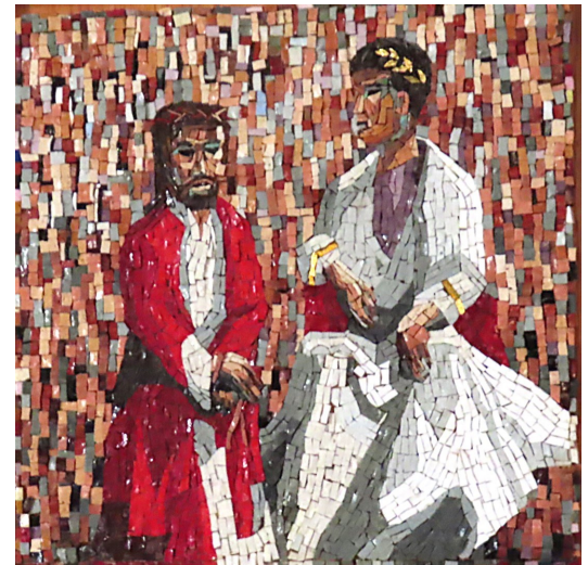
Jesus is Condemned