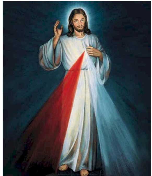
Jesus, I Trust in You